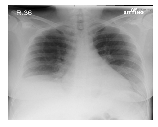
Figure 2. Chest X-ray shows loss of right heart border and splinting of the diaphragm.

The documented mortality of Ogilvie's syndrome ranges