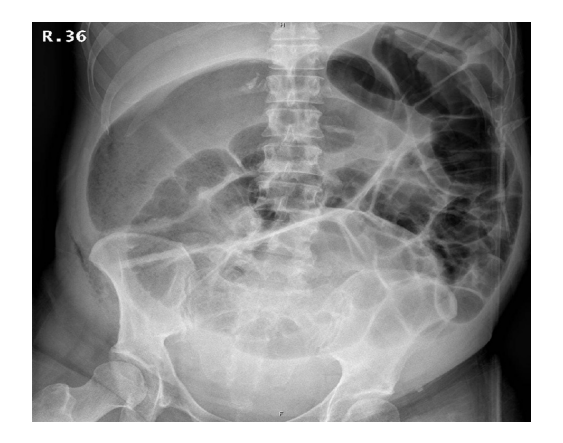
Figure 1. Abdominal X-ray shows grossly dilated bowel loops > 9 cm.

developed a wound infection and dehiscence which settled with antibiotics and vacuum pump therapy.