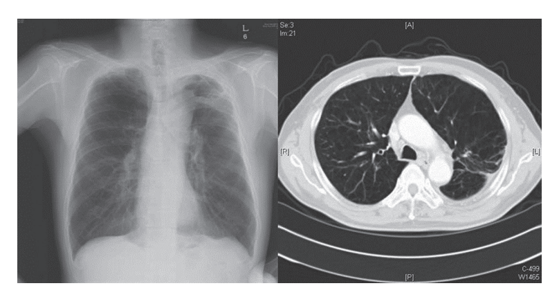
Figure 2. Follow up radiography and computed tomography revealed disappearance of previously seen gigantic bullae and pleural fluid (13 months after admission). Shifting of cardiac border to contralateral side became normal.

To our knowledge, there is rare report of Swyer-James syndrome presenting with disappearance of not only pleural effusion but huge bullae after infectious episode in non-surgically treated patient. Absorption of air and fluid during treatment lead to contracture of pre-existing bullae secondarily [7]. It causes partially auto-bullectomy state and improves lung function by increment of elastic recoil. Replacement of pre-occupying bullae by parenchymal tissue occurs [7]. Follow-up PFT revealed 102% in FVC and 114% in FEV<sub>1</sub>. It is due to loss of compressing effect of bullae to bronchus and pulmonary vasculature. In contrast to FVC, FEV<sub>1</sub> did not reach normal value even showing dramatic increase in PFT. It may be due to pre-existing destruction of small airways in childhood in case of Swyer-James syndrome.