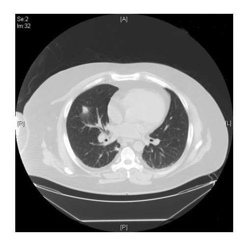
Figure 3. CT chest showing 1.7 cm × 1.3 cm right mid-lung field soft tissue density.

(TTE) as well as transesophageal echocardiogram (TEE) did not reveal any vegetation or intracardiac thrombus (Fig. 4). The patient's clinical status improved. Repeat blood cultures done 3 days after the initiation of antibiotics and 1 day after catheter removal were negative. The patient subsequently underwent placement of Ash catheter in right internal jugular vein and was discharged home on day 11 to complete 6 weeks of IV vancomycin as outpatient. Weekly blood cultures sent for 4 weeks after the completion of the antibiotic course were negative and the patient continues to do well 2 months after the discharge.