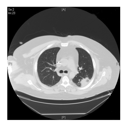
Figure 2. CT chest showing 4 cm \times 2.9 cm density in the superior segment of the left lower lung field.

Patient was started on intravenous (IV) cefepime, linezolid and moxifloxacin for possible health-care associated pneumonia. CT chest revealed multiple areas of peripherally located soft tissue densities within the lungs, the largest one being 4 cm \times 2.9 cm in size. The findings were consistent with septic embolization (Fig. 2, 3). The blood culture grew methicillin resistant staphylococcus aureus (MRSA). CSF culture was negative. The patient was started on IV vancomycin 750 mg with hemodialysis after a one time loading dose of 2 gm and all other antibiotics were discontinued. Given the possibility of CRBSI leading to SPE, Ash catheter was removed. Culture of the catheter tip grew MRSA confirming the diagnosis. Transthoracic echocardiogram