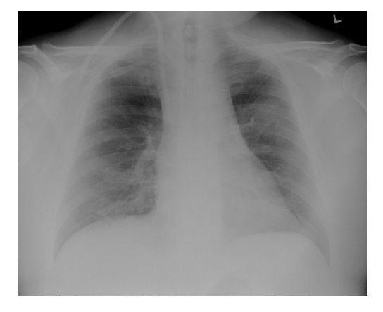
Figure 1. Chest X-ray showing left upper lobe mass like infiltrate and a tunneled ash catheter in the right internal jugular vein.

mal. Cerebrospinal fluid (CSF) analysis showed: clear fluid with white cell count of 13 / \mu L with 90% neutrophils, red cell count of 34500 / \mu L, total protein of 64 mg/dl, glucose of 72 mg/dl (peripheral blood glucose 149 mg/dl) and negative gram stain and India ink.