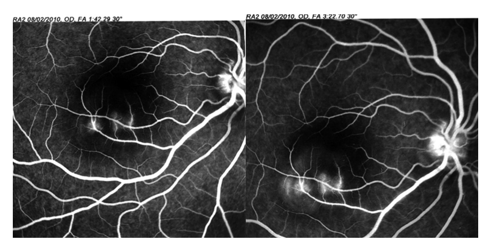
Figure 1. Fluorescein angiography findings of our patient: Multiple leakage points of the dye were observed during the late phase.

patient was a non-pregnant female without any professional or emotional stress and she could not be considered as type-A personality.