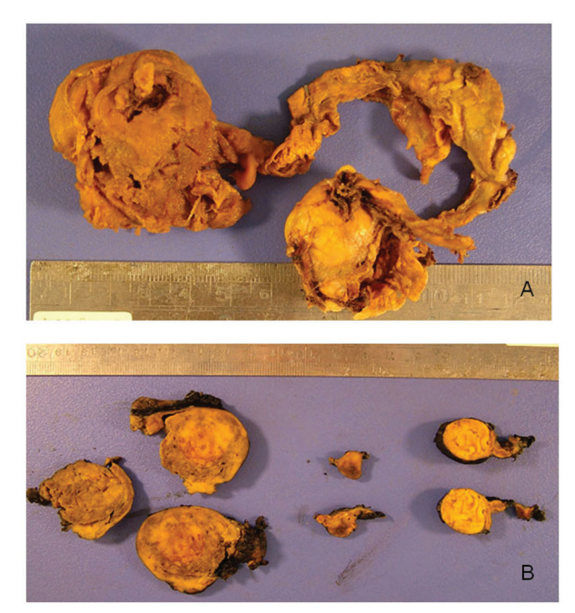
Figure 1. A: Macroscopic appearance of the "adrenal mass" specimen composed of three pieces with a total weight of 36 grams. B: The cut surfaces of the nodules.

a trabecular pattern with abundant eosinophilic cytoplasm and enlarged nuclei (Fig. 2A). These two nodules had fibrotic capsules demarcating them from the adrenal gland. Immunohistochemically, the neoplastic cells in both nodules diffusely stained with chromogranin (Fig. 2B) and sustantecular cells were positive for S-100 (Fig. 2C) whereas neo-