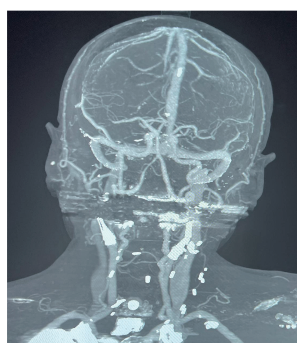
Figure 1. CT with contrast of the head. CT: computed tomography.

numbness, or non-progressive weakness without myopathy is mainly conservative. This includes administration of oral analgesics, a short course of oral prednisone if pain is severe, and physical therapy. The value of surgery for the treatment of cervical radiculopathy has not been clearly established.