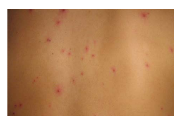
Figure 1. Papulomaculoid exanthema