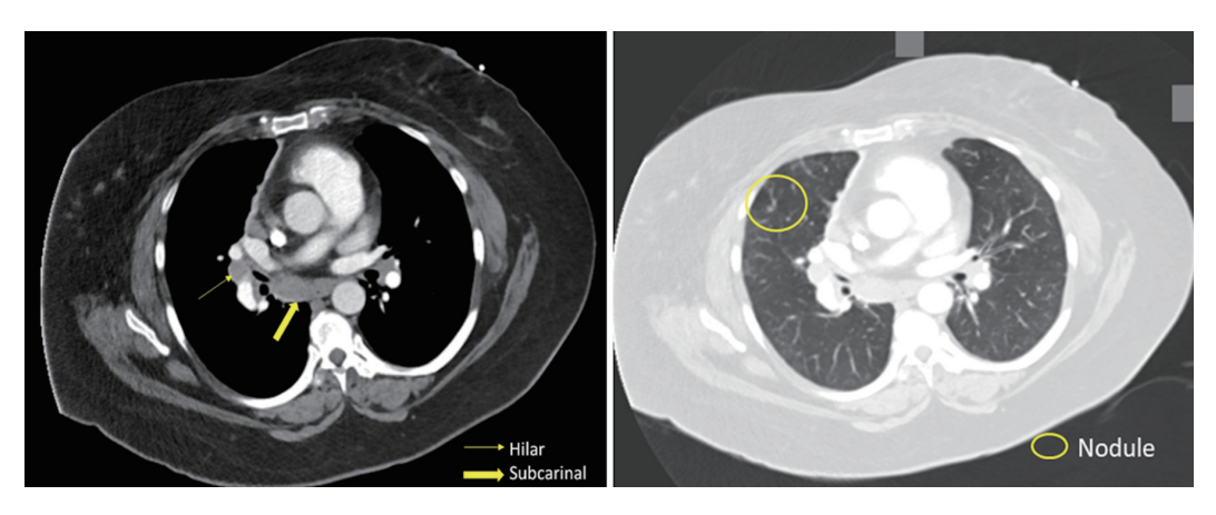
Figure 1. Patient's CT scan of the chest revealing hilar lymphadenopathy, pulmonary nodules, and ground-glass opacifications. CT: computed tomography.

As for the patient's dyspnea, a resting pulse oximeter found the patient's oxygen saturation at 94%; with ambulation, the patient's oxygen saturation levels fell to 80% after 1-min of walking, necessitating 2 L of nasal cannula to rebound to a pulse oximeter reading of 96%. Given this finding, the patient was discharged from the clinic with supplemental oxygen and sent to the emergency department for an acute workup.