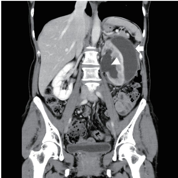
Figure 1. A coronal view on CECT scan revealed a low attenuation fluid collection in the subcapsular area (arrow) in the setting of dilation of the renal pelvis (arrowhead). CECT: contrast-enhanced computed tomography.

cancer in the left common iliac lymph nodes resulted in a subcapsular hematoma. Second, our patient had no symptoms even after the formation of the hematoma.