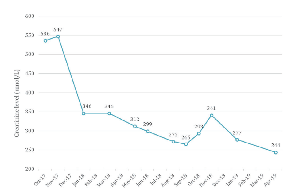
Figure 2. Creatinine trend from presentation in October 2017 to April 2019. Prednisone was commenced in November 2017 which coincided with the improvement in renal function seen then.

g/L (0.08 - 1.40). Serum lipase was normal. Abdominal CT showed no evidence of pancreatitis, lymphadenopathy or retroperitoneal fibrosis.