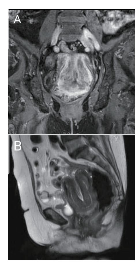
Figure 1. Coronal (A) and sagittal (B) MRI views showing U-shaped uterine cavity with thickened and inverted uterine fundus.

terized by pelvic pain, bleeding, anemia and urinary dysfunction, including urine retention, as in this case, resulting from anatomical distortion causing bladder neck obstruction [6-8].