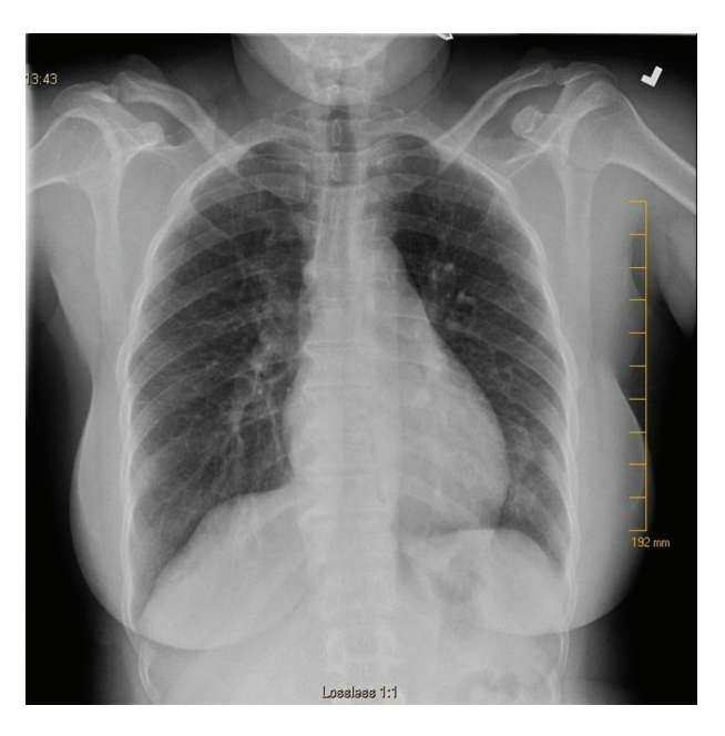
Figure 4. Chest X-ray showing resolution of the nodules after initiation of systemic steroids.

granulomas to form masses up to 5 cm in size [5]. In our case report, the chest CT scan revealed multiple nodules measuring up to 7.5 cm. Patients with nodular sarcoidosis can present with fever, fatigue, weight loss and chronic cough. A study by Abehsera et al to correlate CT scan patterns of sarcoidosis with pulmonary function found that nodular sarcoidosis results in minimal functional impairment [6].