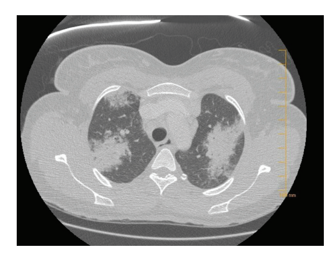
Figure 2. CT of the chest demonstrating multiple lung nodules on both sides of the chest.