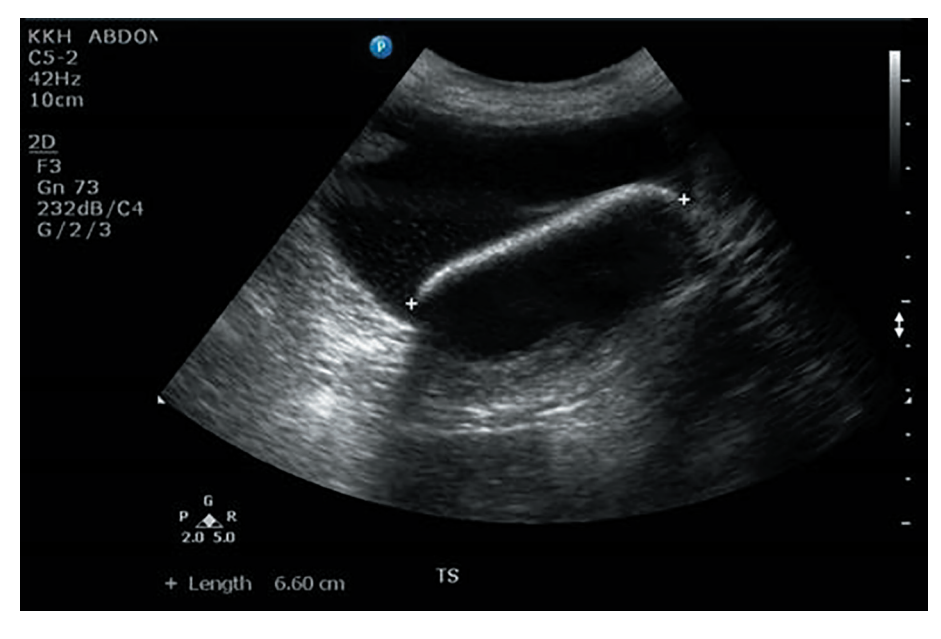
Figure 2. A 6.6 cm bladder calculus seen on ultrasound pelvis.

Small stones less than 5 mm usually pass on their own [10]. In these cases, medication and dietary changes may be all