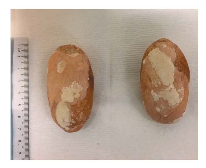
Figure 3. Two giant bladder stones passed out by the patient.

that is needed. Stones of size 5 - 7 mm have a modest chance (50%) of passage, and those greater than 7 mm almost always require surgical intervention [11].