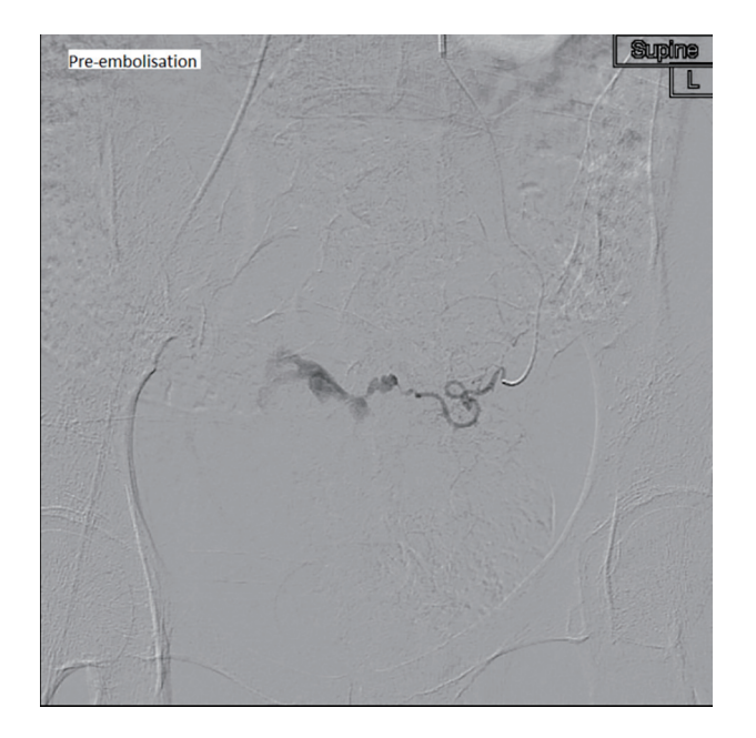
Figure 1. Superselective left uterine artery angiogram showing gross contrast extravasation/pooling medially in the pelvis pre-embolization.

was carried out under ultrasound guidance. A pelvic angiogram done showed profuse contrast extravasation and acute bleeding from the left uterine artery (Fig. 1). A super-selective embolization of left uterine artery was performed. Post-embolization angiogram showed satisfactory results with no further contrast extravasation (Fig. 2). Thereafter the patient recovered well and was discharged well after a week. Currently, 6 months postembolization, she is under follow-up for irregular periods.