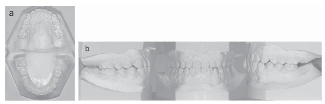
Figure 1. Pre-treatment cast photographs of a 15-year-old male patient (a, b).