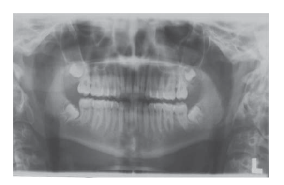
Figure 6. The post-treatment panoramic radiograph of the patient.

Mesial inclination of the impacted mandibular second molar is much more common than distal inclination. In fact, most of the cases reported in the literature show the unerupted mandibular second molar mesially inclined in a oblique or