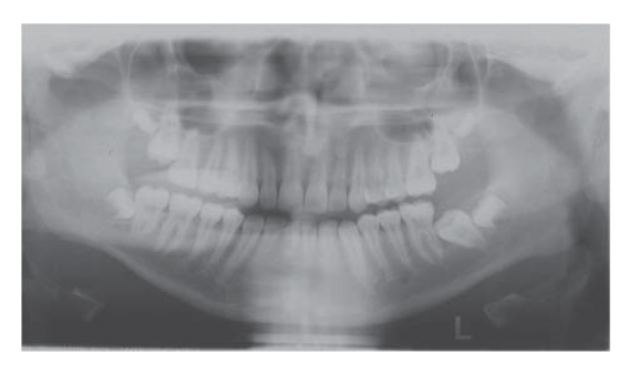
Figure 2. Pre-treatment panoramic radiograph of the patient.