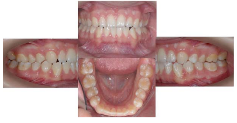
Figure 7. Post-treatment intraoral photograph of the patient.

Advantages of the method: 1), Because of the use of light and intermittent force will minimize the side effect on the anchor molars; 2), Although surgical uprighting of impacted mandibular second molar appear to be a quick and easy procedure, orthodontic uprighting techniques are more advantageous and offer a better long term prognosis with no adverse pulpal or periodontal risk to the tooth or supporting structures; 3), Using of removable appliance with uprighting spring provides distal movement of the mandibular second molar, especially. However, the elastic chain is fixed between the wire on the occlusal surface of mandibular second molar and miniscrew in upper jaw posterior area, transverse