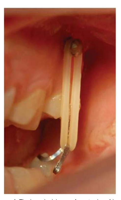
Figure 4. The buccal mini screw for extrusion of lower left second molar.

After using of uprighting spring, a mini screw made of pure medical titanium was used for buccal and vertical