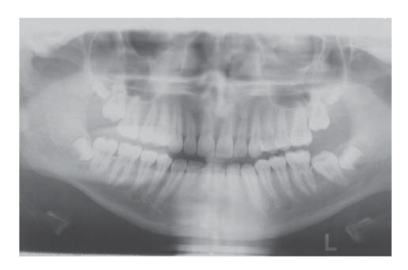
Figure 5. The panoramic radiograph 5 months after the beginning of treatment.

teeth. The hook was changed according to movement of the tooth. After two months, elastic chain altered (3/16, 6 oz.).