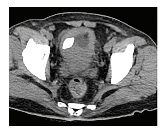
Figure 3. Computed tomography showing urinary bladder stone.