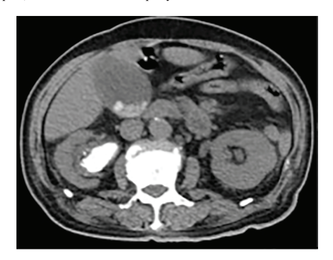
Figure 2. Computed tomography of abdomen showing right staghorn stone.

One year later, he developed another severe episode of UTI with Klebsiella bacteremia and septic shock, which failed to respond to broad-spectrum antibiotics and inotropic support, and he deteriorated rapidly and died.