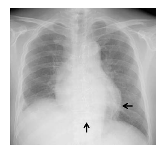
Figure 2. Chest radiography shows calcification on the posterior and inferior parts of the cardiac silhouette (arrow), with four wires fixing the sternum.

These findings were compatible with chronic CP and