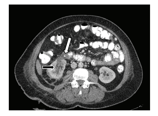
Figure 2. In this CT image, the tract of the nelaton catheter which was used during the procedure may be seen clearly (black arrow). The white arrow points to the displaced calculus which was originally thought to represent extravasated oral contrast from the duodenum.

A follow-up plain CT scan obtained after a week demonstrated no change in the size and configuration of the opacity.