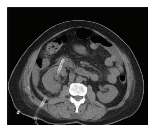
Figure 3. The nelaton catheter, its tract through the kidney and the calculus, can all be seen in a demonstrative fashion in this CT scan.

The patient did well and was discharged from the hospital a few days later.