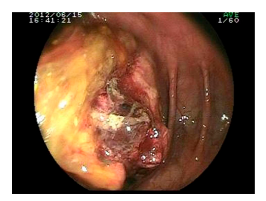
Figure 2. Mass lesion at the neighborhood of cecum on colonoscopic examination.

mass lesion. Laboratory data revealed normal hemoglobin (14 g/dL), white cell count (9,810,000/ \mu L) and platelet count (351,000,000/ \mu L). Erythrocyte sedimentation rate was 10 mm/h and C-reactive protein was 0.54 mg/dL. Urea, electrolytes, amylase and liver function tests were also normal, but lactate dehydrogenase was slightly raised (274 U/L (125 - 220)). Fecal leukocyte and erythrocyte was detected in stool examination. Stool antigen for E. histolytica was also positive. Intravenous fluids and metronidazole were started immediately and bloody diarrhea disappeared after treatment. However, colicky abdominal pain persisted and abdominal computed tomography with oral and intravenous contrast was performed. A 13-cm lesion with invaginated intestinal loops at the pelvic midline was detected (Fig. 1). There were