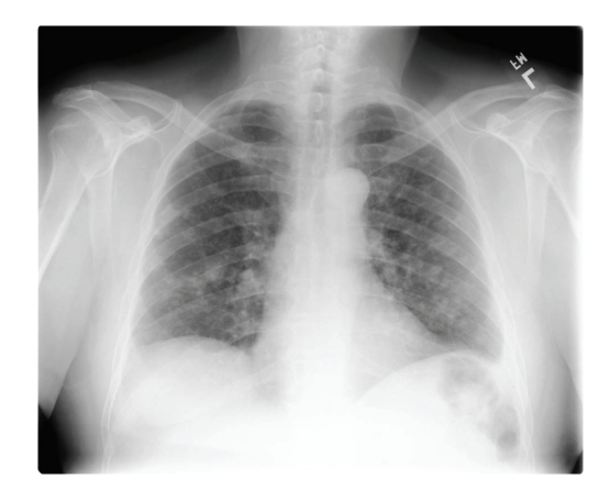
Figure 1. Frontal radiograph of the chest showing multiple bilateral pulmonary nodules.

On presentation, he had no pertinent complaints. Vital signs were within normal limits including an oxygen saturation of 98% on room air and a normal respiratory rate. Laboratory testing was notable for a normal PSA at 1.44 g/mL. Complete blood count and chemistry panel were also within