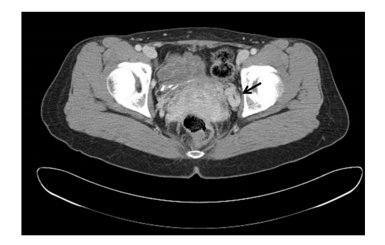
Figure 1. Abdominal computed tomography. Congested varicose vein and dilated left ovarian vein (arrow) were observed.