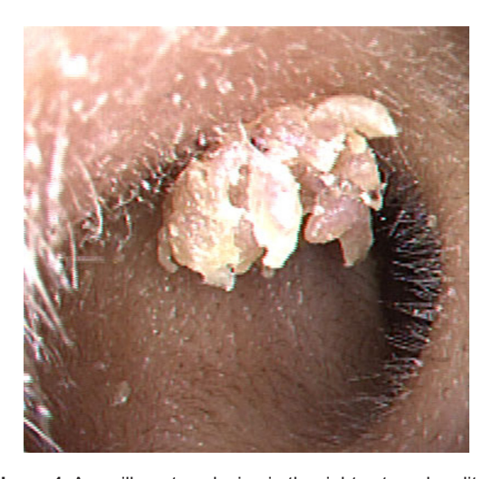
Figure 1. A papillomatous lesion in the right external auditory canal. Note finger-like projections at the surface.

Squamous papillomas are caused by the human papilloma virus (HPV), a DNA virus of the Papovaviridae family [2]. Aural papillomas are generally associated with HPV types 6 and 11. Clinical presentations of HPV infection are various; common warts, vulvar or oral papilloma, epidermodysplasia verruciformis, keratoacanthoma, etc [3]. Squamous papil-