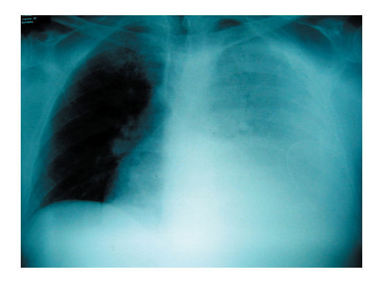
Figure 4. Posteroanterior chest radiograph at presentation with the hemothorax. A large left pleural effusion is prominent.