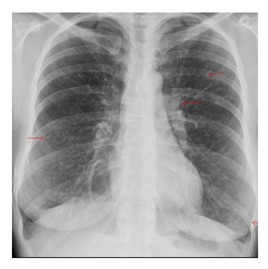
Figure 1. Ms X's lung X-ray showing the bilateral pattern of reticulo-nodularity.

with a normal iron profile, as her TSH, B12 vitamin and folic acid. A haemolytic anemia is diagnosed with LDH at 720 U/L (upper limit of normal range 205 U/L) and haptoglobin less than 0.07 g/L (lower limit of normal range 0.35 g/L). This anemia is found to be reactive with cold agglutinins anti-I IgM.