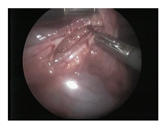
Figure 2. Cystic wall was involved by phrenic nerve.

The surface of the cyst was covered by pericardial fat tissue. The mass was attached to the pericardium, and there was no connection with the anterior-upper mediastinum, thymus or lung. After multiple fenestrations, we removed 350 mL of serous fluid and most of the cystic wall which had a wide connection with the pericardium and involved pericardial fat tissue and phrenic nerve (Fig. 2). We could not find a layer that could easily be prepared and large-scale resection of the pericardium would have necessitated replacement. Accordingly the internal layer of the cyst was fully resected macroscopically after dissection of the nerve, only a small part of the external layer being left on the pericardium. A 14 Ch thoracic drain was inserted for 24 hours. The patient was discharged on day postoperative 3 in a good condition. The histologic diagnosis was a benign multilocular thymic cyst within the Hassal bodies in the cystic wall. The wall of the cyst exhibited varying thickness and contained scattered nests of thymic tissue including small lymphocytes and epithelial cells. There were no complications and no sign of recurrence during the 18-month follow-up.