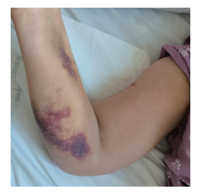
Figure 4. Resolution of the right upper limb hematoma after complete rituximab cycle, 4 weeks from the initiation of the treatment.

Our case highlights the complex management of bleeding episodes of these patients, which often requires the administration of multiple therapeutic agents. As far as our patient is concerned rituximab treatment associated with corticosteroids