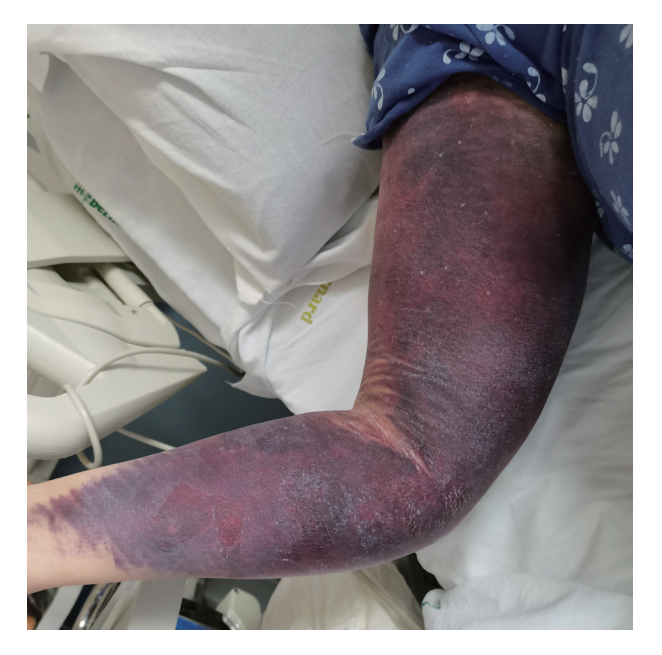
Figure 3. Right upper limb hematoma due to blood sampling, occurred during therapy with recombinant porcine factor VIII.

tial clinical and laboratory response, being the detected FVIII plasma levels lower than expected. A midline venous catheter was positioned 30 min after Obizur infusion, due to the excessive leakage of blood in the subcutaneous tissues occurring while drawing blood to check for laboratory testing. After 4 days of rpFVIII treatment, once Hb levels were stable enough, a treatment course with activated prothrombin complex concentrate (Feiba, Takeda) was carried out, at the initial dosage of 100 IU/kg every 12 h on the first day, gradually adjusted up to 50 IU every 12 h for 13 days with a successful control of the bleeding episodes. Considering that the patient presented high-titer FVIII inhibitor and the very low FVIII level, a more intensive immunosuppressive strategy with rituximab (375 mg/m<sup>2</sup>) was necessary to control the underling autoimmune process once a week for 4 weeks.