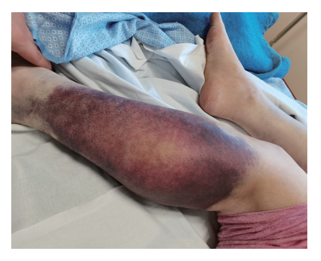
Figure 1. Spontaneous left lower limb hematoma which was already present at the time of hospital admission, prior to the start of any therapeutic interventions.

episodes and other prior disease states or medical therapies other than a few days of low-grade fever (37.4 ^{\circ} C) and flulike symptoms such as cough, sore throat, generalized malaise and ageusia a few weeks prior to the development of the hematomas.