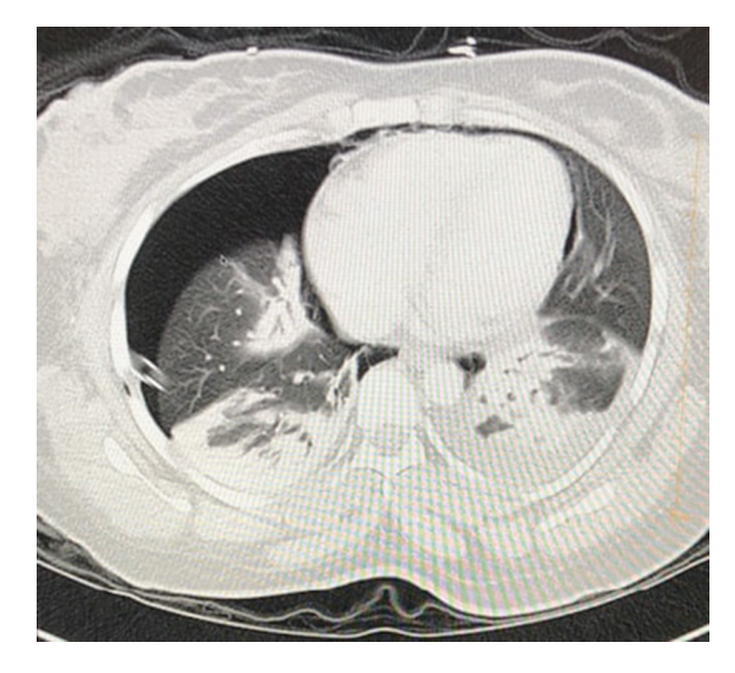
Figure 1. Pneumothorax after ERCP on CT imaging.

Common complications of ERCP include pancreatitis, bleed-