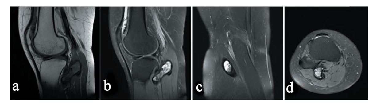
Figure 3. Preoperative magnetic resonance image (MRI) of the right knee. Sagittal T1-weighted image (a), sagittal T2-weighted image (b), coronal T2-weighted image (c), and axial T2-weighted image (d) reveal a mass in the gastrocnemius lateralis muscle. Thickened synovium with low signal intensity on both T1-weighted and T2-weighted images is found in the knee joint.

sule (Fig. 4). The surrounding soft tissue was normal. A preoperative diagnosis of diffuse PVNS was considered, and the intramuscular cyst was believed to be arising from PVNS.