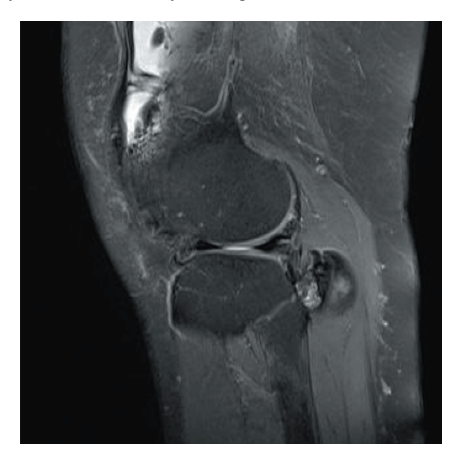
Figure 4. Preoperative magnetic resonance image (MRI) of the right knee. Sagittal T2-weighted image showed the cyst wall to be attached to the knee joint capsule.

We have described two rare intramuscular cysts, thus highlighting the need for consideration of intramuscular ganglion cyst or intramuscular cyst arising from PVNS, in the differen-