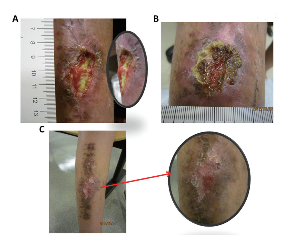
Figure 2. Case 1: the post operation wound. (A) The wound was 3.5 \times 2.5 cm, located at the front side of left lower leg, consisted of 60% granulation tissue and 40% slough, and was detained for more than 3 months. The smaller oval-shaped figure: lateral view. (B) The photo on day 28. (C) The photo on day 56. The smaller oval-shaped figure: magnified view.

healing in clinical wounds remains controversial [18, 19], its broad-spectrum antibacterial activity still attracts attentions for a variety of biomedical applications, including wound care products.