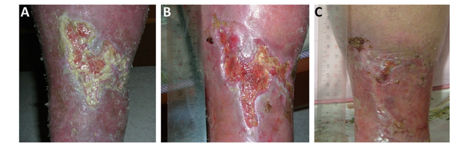
Figure 4. Case 3. (A) A 10 \times 10 cm leg ulcer was located on the calf with hemorrhage and malodor before the intervention of Ag/ ACF. The yellow cream was the traditional Chinese herbal medicine. (B) The photo on day 16. (C) The photo on day 32.

Compared to other commercially available silver-containing dressings, this Ag/ACF dressing exhibited lower cytotoxicity to fibroblasts and similar antibacterial activities in vitro, and promoted in vivo wound healing in a greater degree [20, 23]. Another similar dressing product, which comprises silver impregnated charcoal activated carbon cloth enclosed in a sleeve of non-woven nylon, also presented an ability to remove bacteria from wound exudate [13], and a high in vitro endotoxin-binding capacity [24]. Besides the huge adsorptive capacity for micro-organisms, toxins, wound degradation byproducts, and odors, ACF has a remarkable advantage which all the other dressings lack - stable emission of far-infrared ray (FIR) [25], which has been proven to promote wound healing possibly by stimulating the secretion of transforming growth factor \beta 1, the migration of fibroblasts, or the production of collagen fibers due to the activation of fibroblasts [26]. Although