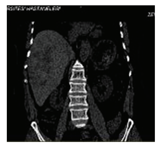
Figure 1. A 60-year-old female patient presented with right upper abdominal pain and fever lasting 16 weeks. Abdominal computerized tomographic examination showed hypodense lesions in the right lobe of the liver.

mentation rate 40 min/h; and C-reactive protein: 20 mg/L; alanine aminotransferase (ALT) level was 65 U/L (normal, 5-37), aspartate aminotransferase (AST) level was 49 U/L (normal, 5-37), and alkaline phosphatase level (APL) was 266 U/L (normal, 32-155). Tumor markers including alpha fetoprotein, carcinoembryonic antigen, and carbohydrate antigen 19-9, were all within the normal range. In addition, no viral markers were detected.